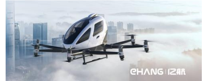
Pictured: An image of a pilotless passenger drone.

Chinese companies are paving the way for people to be transported from city to city in pilotless passenger drones! A transportation company, called EHang, has asked the government to approve a commercial licence for them to start operating around the city of Guangzhou. It's the capital and largest city of Guangdong province (in southern China) and could soon see the drones being booked like taxis. EHang plans for their two-seater, EH216-S, to fly along a pre-programmed route with no pilot. The battery-powered craft can stay airborne for up to about 25