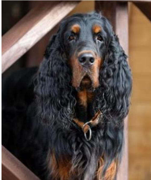
Pictured: A beautiful Gordon Setter, the same breed as Sharwood.