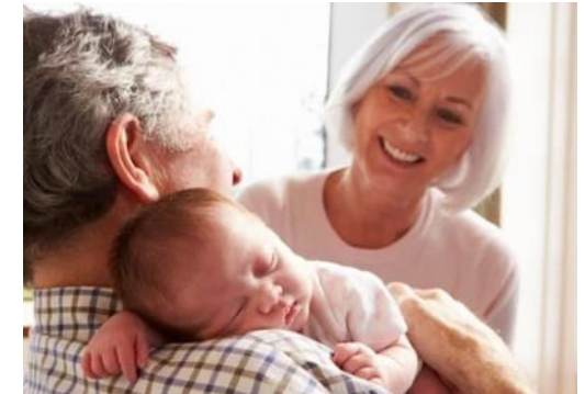
Pictured: Grandparents looking after their new grandchild.

spending time with my granddaughter, and now I can help her parents too!' This new rule is helping grandparents make memories with their grandchildren and giving parents a little extra help. Do you think this is a good idea?