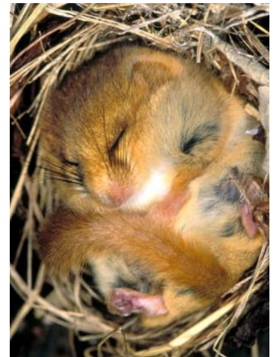
Pictured: A hibernating dormouse.