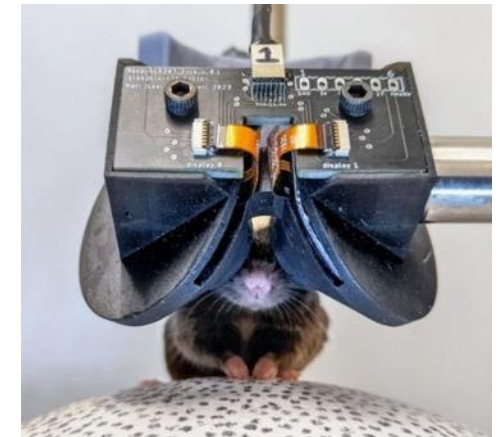
Pictured: MouseGoggles being worn by a mouse.