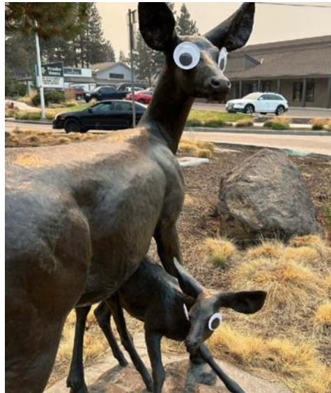
Pictured: Googly-eyed sculptures in Bend, Oregon.

In the city of Bend, Oregon, some people have been adding googly eyes to statues! The funny plastic eyes appeared on sculptures, like a statue of two deer and a giant metal sphere, making the artworks look quite silly. But the city council isn't laughing. They've asked people to stop because it costs a lot of money to remove the eyes without damaging the art. 'While the googly eyes [...] might give you a chuckle, it costs money to remove them with care to not damage the art,' said a council spokesperson. The council explained that decorations like Santa hats and wreaths have