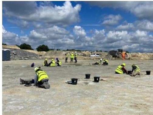
Pictured: The excavation team on site at Dewars Farm Quarry.

The UK's biggest ever dinosaur trackway site has been excavated at Dewars Farm Quarry, Oxfordshire. Over 200 dinosaur footprints have been discovered, including those of Megalosaurus (a large, meat-eating dinosaur that walks on two legs) and Cetiosaurus (a plant-eating sauropod dinosaur that walks on four legs). Imprinted into the limestone floor around 166 million years ago, five