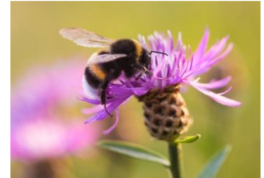
Pictured: Bumblebee.

Do you have any ideas to help increase their numbers more?