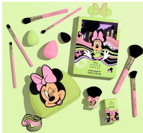
Pictured: Spectrum's Minnie Mouse collection.