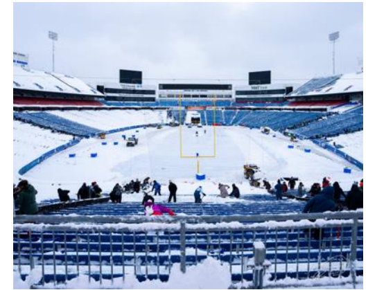
Pictured: American football fans work together to clear snow from the Highmark Stadium in Buffalo.

A huge snowstorm hit parts of the US over the Thanksgiving holiday weekend, with some places getting over three feet of snow! In Buffalo, New York, people grabbed shovels to help the Buffalo Bills American football team clear their stadium before a big game. Governor, Kathy Hochul, said, 'The snow is heavy, but New Yorkers are tougher!' Snowstorms like this are known as lake-effect snowfall; they happen when cold air blows over the Great Lakes, creating fluffy snow. Some areas can see up to six feet of