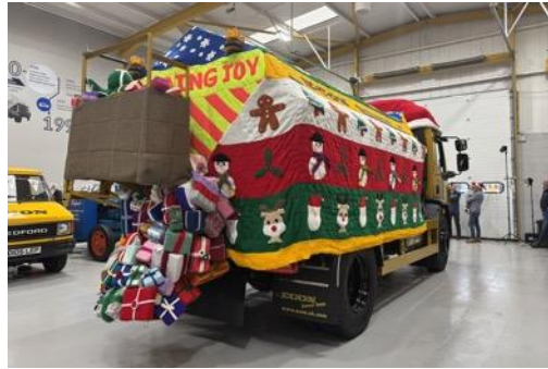
Pictured: Goldie the Gritter dressed in her knitted jumper, and with children from Outwood Primary Academy Greystones.