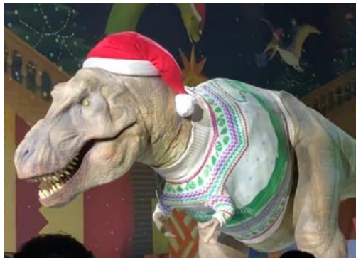
Picture: T. rex flaunting his Christmas jumper!

Do you have a special jumper that you wear at Christmas time?