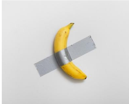
Pictured: Maurizio Cattelan's 'Comedian'.

A famous piece of art, featuring a banana taped to a wall, has been sold for almost five million pounds! The famous artwork by Italian artist, Maurizio Cattelan (created in 2019), is a fresh banana affixed to a wall with duct tape. Justin Sun, founder of cryptocurrency platform TRON, who bought the piece, said it, 'represents a cultural phenomenon that bridges the worlds of art, memes, and the cryptocurrency community.' Named the 'Comedian', what has actually been bought is a certificate of authenticity with detailed diagrams and instructions for its proper display. Justin added, 'In the coming days, I will personally eat the banana as part of this unique artistic experience, honouring its place