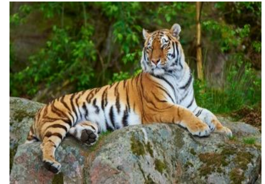
Pictured: A Siberian tiger.