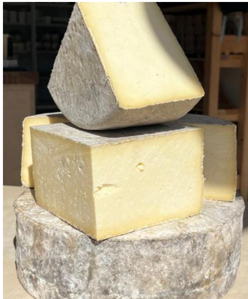
Pictured: Tasty cheese at Neal's Yard Dairy.

we want to support our small dairy suppliers.' Police arrested a 63-year-old man, who they think was involved, and they're still investigating the cheesy mystery. Neal's Yard hopes the missing cheese will soon be found!