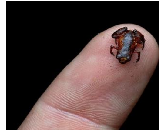
Pictured: Brachycephalus Dacnis.