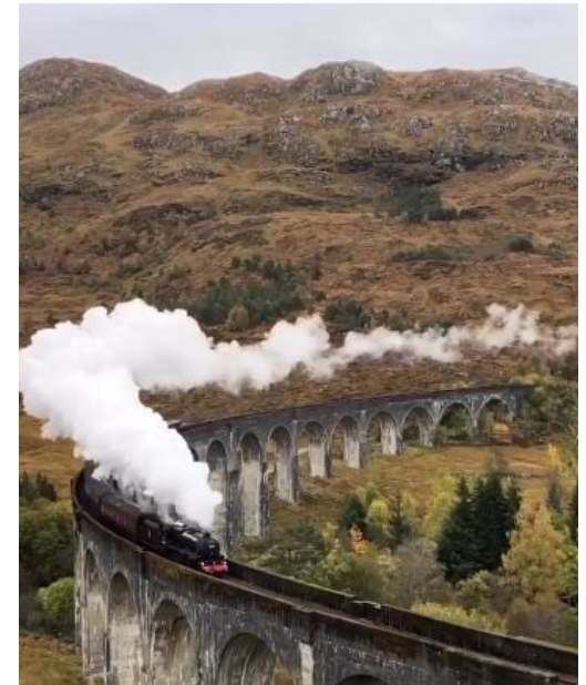
Pictured: The iconic Glenfinnan Railway Viaduct.