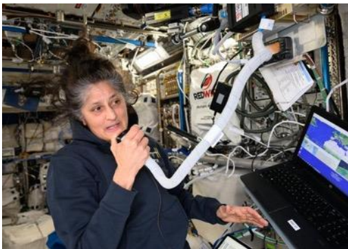
Pictured: Sunita Williams talking with girls from the Girlguiding organisation from the ISS.

What would you like to ask an astronaut? Do you have any questions about the ISS?