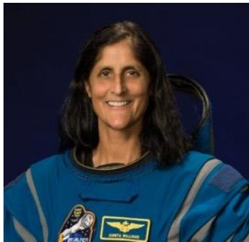
Pictured: Sunita Williams.

Children at Robert Drake Primary School in Thundersley, Essex, were given the unique opportunity to speak to an astronaut aboard the International Space Station (ISS). 250 miles above Earth on the ISS, Sunita Williams was on hand to answer all their space-related queries. The NASA Astronaut and Starliner Crew Flight Test Pilot talked about training to go into space, and what it was like to be on the space station – including what there is to eat and do for fun!