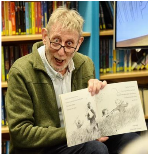
Pictured: Michael Rosen reading his famous story, We’re Going on a Bear Hunt.

Words. He’s excited to see young people enjoying stories and believes they’re writing more than ever, through social media and texting. ‘When I see children laugh and enjoy stories, it feels like magic,’ he added.