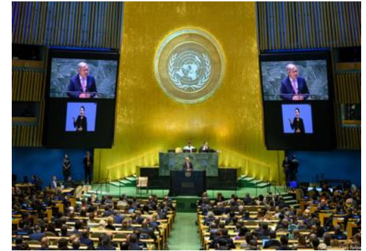
Pictured: Debating at UN Headquarters in New York, USA.

Leaders from around the world are meeting at the United Nations (UN) Headquarters in New York City, to talk about big problems facing the planet. The UN was created after World War II to help countries work together for peace, human rights, and helping people in need. Today, almost every country in the world is a member, and when issues or problems arise, the UN is one of the first places where countries share their concerns. This year, the UN will meet for the 79 th time! There are many important issues to discuss,