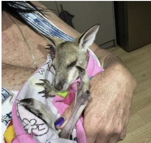
Pictured: Rescued Joeys being cared for at the centre.