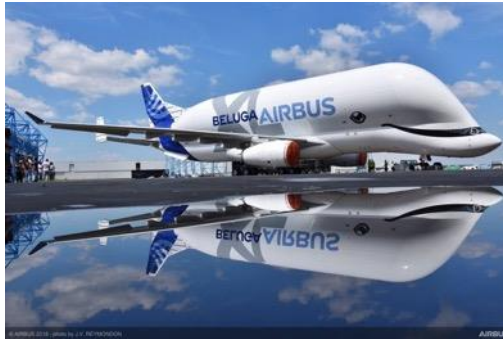
Pictured: The Airbus BelugaXL.

Plane spotters were excited to watch as an Airbus Beluga made a rare landing at London's Heathrow Airport. The unusually-shaped transporter was carrying parts for a plane that has been grounded since earlier this year. The vehicle is reported to be the 'world's most bizarre plane'. Due to its oversized cargo hold on top, it resembles a beluga whale. The Airbus A300-600ST (Super Transporter), or Beluga, is a specialised wide-body airliner used to transport aircraft parts and outsize cargo, such as helicopters!