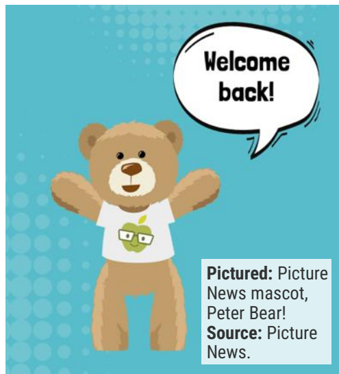
Pictured: Picture News mascot, Peter Bear!