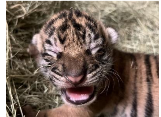
Pictured: The Sumatran tiger cub at San Diego Zoo Safari Park.

San Diego Zoo Wildlife Alliance are celebrating the birth of a Sumatran tiger cub at San Diego Zoo Safari Park, in California, USA. The zoo shared, 'First-time mum Jillian gave birth to a healthy male cub 🇬🇧. Mum and cub are both healthy and bonding behind the scenes. With less than 600 Sumatran tigers left in the wild, this birth is incredibly significant for the genetic diversity of the population 🐅❤️'. Sumatran tigers are critically endangered and the tigers at San Diego Zoo are part of a worldwide 'Species Survival Plan'. The park is very proud of their new tiger mum and her keepers. Senior Vice President, Lisa Peterson, said, 'Jillian's care team has done an exceptional job monitoring her and her cub throughout this process, and it has been a joy for them to watch her enjoy motherhood. We hope this cub will allow our guests to gain a greater