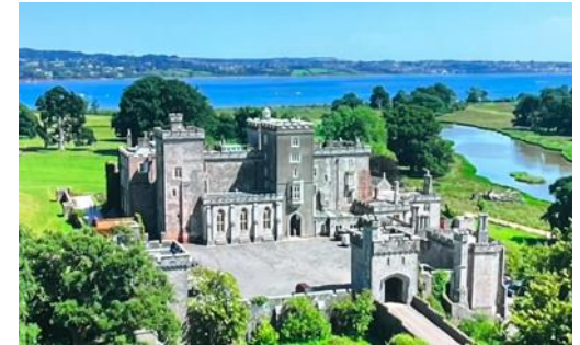
Pictured: Powderham Castle, Exeter.