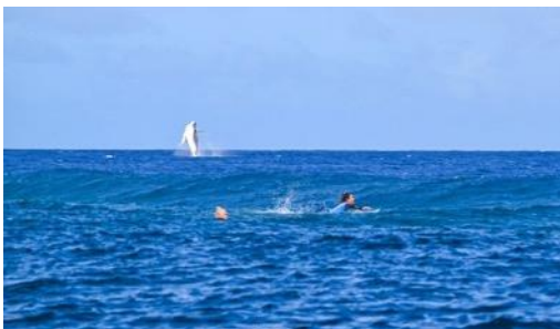
Pictured: A whale photobombing the Tahiti surfing semi-final.

Do you enjoy taking photographs? What would be your dream photography project?