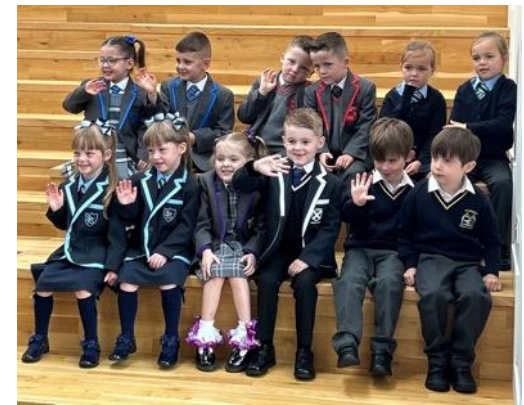
Pictured: Six sets of twins sitting on the 'singing steps' at St Patrick's Primary in Greenock, before starting school.