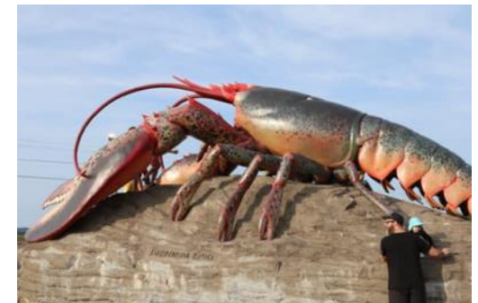
Pictured: A typically-coloured live lobster.

very unique! Instead of being cooked and served as a meal, the restaurant decided to save the orange lobster. They knew it was too special to be eaten! The lobster has been given a new home at a nearby aquarium, where people can visit and see it up close.