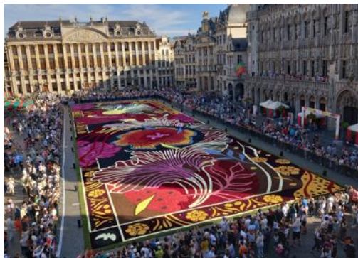
Pictured: The beautiful flower carpet on display in the Grand Place, Brussels.

celebrates with music, lights, and even fireworks at night! The flowers smell wonderful, and the bright colours make the square look like a giant painting. The Brussels Flower Carpet is not only a stunning sight but also a way for people to come together and celebrate the beauty of nature. It's a tradition that makes everyone smile!