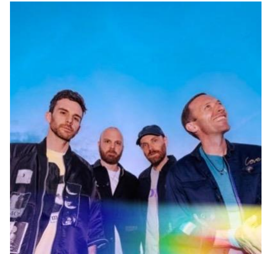
Pictured: Coldplay.

Coldplay's new album is going to be their most eco-friendly album yet - made from recycled plastic collected from rivers! Coldplay, working with Ocean Cleanup, have announced that when their 10 th record is released in October, the vinyl copies will each be made from nine recycled plastic bottles. The British rock band's upcoming album, Moon Music, will be a world-first for sustainable vinyl production. Coldplay are one of the best-selling music acts of all time, with over 100 million albums sold globally. This is not the first time that the band have considered their impact on the environment. They actively reduced the carbon footprint of their last tour by making changes to be more environmentally friendly, such as, using solar powered lights and sustainable aviation fuel.