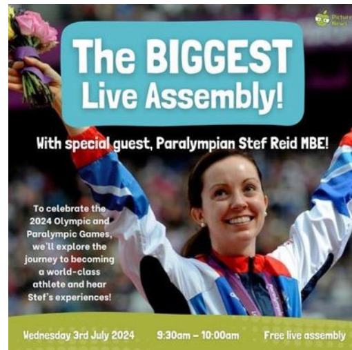
Pictured: All about our live online assembly.

Can you think of a question that you would like to ask Stef? Do you have a favourite Olympic sport? Will you be watching the Paris 2024 Olympic Games?