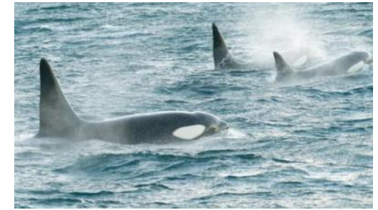
Pictured: A pod of orca whales.

Reports have recently highlighted an issue that orca whales seem to be attacking small boats and fishing vessels off the coasts of Spain, France, Morocco and Portugal. The whales have intentionally collided with nearly 700 boats, causing at least seven of them to sink and damaging many others. While orca are known to work in groups to hunt prey, they are rarely aggressive towards humans, so the behaviour is puzzling for experts. A team of marine biologists has been observing a pod (group) of whales and they are beginning to believe