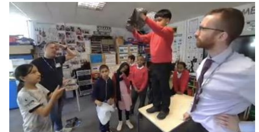
Pictured: Year 5 conducting an air resistance experiment.