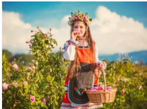
Pictured: Picking roses in the Rose Valley, Bulgaria.

all the hard work that goes into cultivating these pretty flowers. The roses are very delicate so even slight changes in weather can easily ruin them. The flowers must also be picked before lunchtime to avoid the heat of the sun drying out the precious petals. Three main events make up the festival itinerary - the electing of Queen Rose, the harvesting ritual in the rose gardens and the parade along the streets of the town.