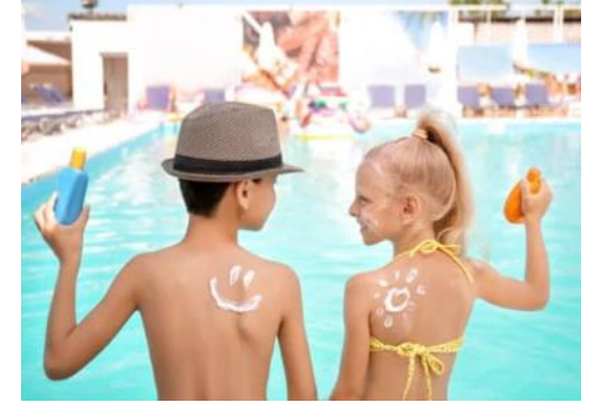
Pictured: Applying sun cream.

The sun is an essential part of life on Earth, providing light, warmth and energy. Sunlight can be good for humans, as it helps the body to produce vitamin D that keeps our bones strong, and it boosts our mood! However, it can also be harmful to our skin. Did you know that our skin is an organ? In fact, it is the largest organ in the human body! It acts as a barrier to protect the inside of our bodies from the outside world, so it is important that we take care of our skin. In the summer months, we can use sun cream to help protect our