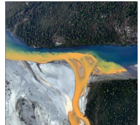
Pictured: Kutuk River, Alaska.

problem for communities that use the rivers for drinking water as well as for fishing. Researchers are currently in the middle of a three-year project which is aimed at understanding the problem better and finding the right solution.