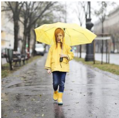
Pictured: Walking in the rain.

While the UK is no stranger to wet weather, some forecasters are predicting a seriously soggy summer which could see fifty days of rain. That is ten more days of rain than the country had last summer. In order for a day to be classed as 'rainy,' there must be a minimum of 2.5mm of rainfall within 24