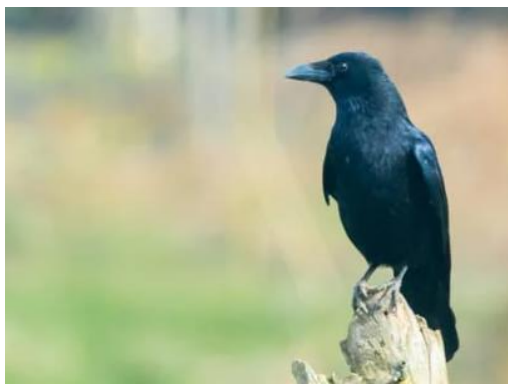
Pictured: A carrion crow.

Recent research has revealed that crows may be able to count up to four! The birds are known for their intelligence and their cheeky ways, but this new discovery has amazed scientists. The study involved showing a quantity of objects to the crows, who then responded with a number of cries to match. The crows were right more times than not, and they were rewarded for a