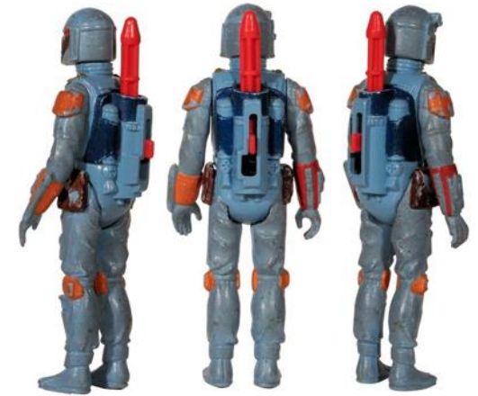
Pictured: The hand-painted, missile-firing Boba Fett vintage toy.

A Star Wars Boba Fett action figure has been sold by Heritage Auctions for £411,000! The 1970's hand-painted, missile-firing Boba Fett toy is now the world's most valuable vintage toy. Created in 1979, it was never released to the public as it was deemed a choking hazard. Only two of this super rare model of the bounty hunter are still in existence. 'The rocket-firing Boba Fett action figure long ago became such a mythic icon that people worldwide know about it even if they don't collect anything at all,' said Joe Maddalena from Heritage Auctions. 'We knew this one had a chance to enter the record books, and it was thrilling to see it become the most valuable toy in the world.' The previous title holder was a one-of-a-kind Barbie wearing a one-carat diamond, which sold for £236,000 in 2010.