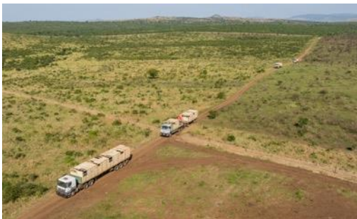
Pictured: The transportation of forty rhinos to the Conservancy.

Do you know any white rhino facts? Have you heard about any other rewilding projects in Africa or other parts of the world?