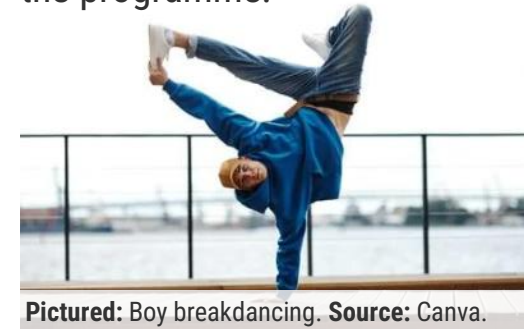
Pictured: Boy breakdancing.

be judged on their unique style and flair on the floor. To date, the Olympic sport considered closest to dancing is figure skating, which takes place during the winter Olympics. Competitive dancing was initially considered for the Tokyo 2020 Games but did not make it through, so dancers across the globe are thrilled to see a different dancing sport on the programme.