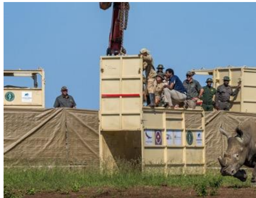
Pictured: A rhino being released.