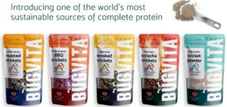
Pictured: Bugvita ingredients and snacks made from crickets. All farmed and packaged in the UK.

A survey has found that the 'disgust factor' needs to be overcome if eating insects is to become mainstream in the UK. The recent study showed that of the 603 people asked, only 13% would be willing to regularly eat insect snacks. 47% said they would not. Younger people involved in the survey were less open to consuming insects regularly. Researchers are exploring why people in the UK are so unwilling to eat insects, as they say insects provide a more sustainable way to produce food that could reduce our carbon footprint. In Asia, Africa and Latin America, it is estimated that hundreds of millions of people already eat insects as part of their diet. 'Insects are a potentially rich source of protein and micro-nutrients and could help provide a solution to the double burden of obesity and undernutrition,' said study lead, Dr Lauren McGale, from Edge Hill University in Lancashire. 'Some insect