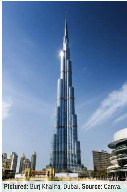
Pictured: Burj Khalifa, Dubai.

the Empire State Building stands at 381m (1250ft). It may not be the tallest building in the world, but it does hold the record for the most photographed building!