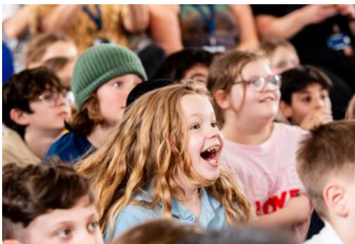
Pictured: Assembly excitement!

a project which aims to provide arts and music education for all children. The headteacher explained that none of the children had known about the visit, and 'their faces were amazing when we opened the door.' He also added that Ed 'was absolutely brilliant, an amazing person and very humble.' As a parting gift, the popstar left the school five of his own guitars!