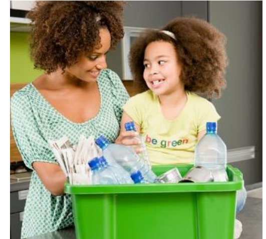
Pictured: People with all their recycling in one container.

Recycling Minister, Robbie Moore, has announced that a new, easier approach to recycling will be introduced in England. The new rules, brought in by the government, mean that households will be able to put all their recycling together for one collection. Ministers hope that this simpler idea will help boost recycling levels across the country. Recycling collectors will accept plastic, metal, glass, paper and card in one bin. English councils will also be able to take food and garden waste at the same time. Robbie Moore said, 'We all want to do our bit to increase recycling and reduce the amount of waste sent to landfill – but a patchwork of different bin collections across England means it can be hard to know what your council will accept. Our plans for Simpler Recycling will end that confusion: ensuring that the same set of