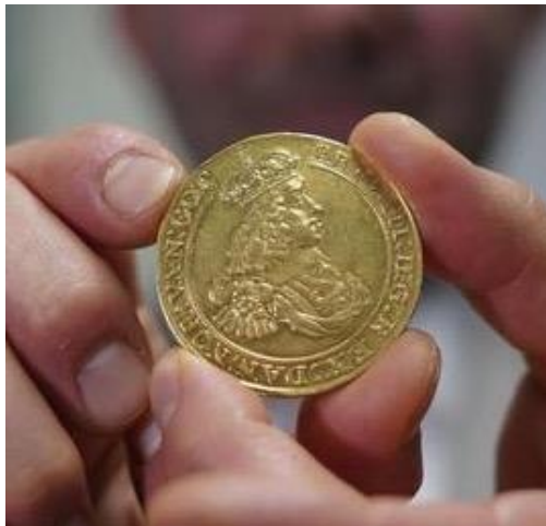
Pictured: A coin from the collection.

of Scandinavian coinage, saying, 'They are described in literature as the only existing specimen of this kind. The pure fact that this collection has been closed for a hundred years makes it a legend. It's like a fairytale.' Do you have a collection, or know anyone who does? What do you think would be an interesting item to collect?