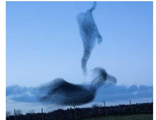
Pictured: Starling murmuration.

short and bird poo landed on his head! He added, 'It was fun to start with, it was great to watch. But it's just the mess it makes.' Others are taking measures including washing windows every day, covering cars and furniture with plastic and remembering an umbrella!