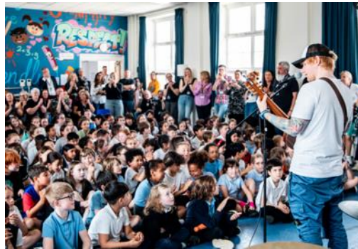
Pictured: Ed performing at the Brighton primary School.

Children at the Fairlight Primary and Nursery School were flabbergasted when, who should enter their Friday assembly, but Ed Sheeran! The superstar singer performed three of his hit songs and then spoke to the children about his life in the music industry and the importance of learning about music. The visit was organised by Create Music,