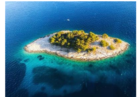
Pictured: Desert island.

Three sailors have been rescued from a remote Pacific island after being stranded there for a week following an accident involving their fishing boat. The fishermen's boat was struck by a large wave, damaging the outboard motor. When the mariners attempted to make contact with coastguards, they found their radio had run out of battery. Luckily, the men managed to swim to a small, nearby island called Pikelot Atoll, where they cleverly fashioned a 'help' sign using palm fronds. The search for the sailors began in early