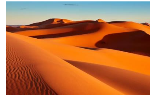
Pictured: Star dunes.

Sand dunes are large bodies of sand that are moulded and shaped by the wind. They can be found across the world and even on Mars! The largest sand dune on Earth is the Lala Lallia in Morocco, Africa. It is nearly as tall as Big Ben and is the width of about seven football pitches. Scientists believe this sand dune is about 13,000 years old. This particular sand dune is known as a star dune. This is because, as the fierce wind changes direction often, the dune forms different branching ridges, giving it the appearance of a star. While