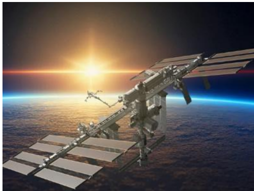
Pictured: International Space Station.