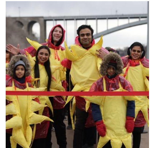
Pictured: People dressed as the Sun at Niagara Falls.

wearing red ponchos with yellow suns hanging over their chests. Do you enjoy getting dressed up for occasions? Do you think it helps to make them more special?