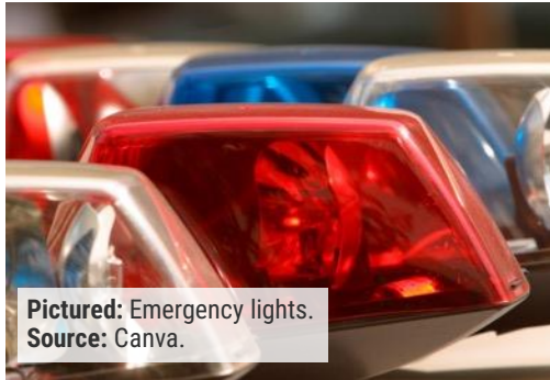
Pictured: Emergency lights.

A bird who lives outside a police station in Oxfordshire has learnt to mimic the sound of a police siren. Thames Valley Police, at a base in Bicester, released a video of the bird singing, and the copycat call sounds just like a police siren going off. Officers at the base admitted that they were initially confused and thought that their cars may have developed a fault! Further investigation revealed that the cars' sirens were in full working order. The bird was tracked down and its 'siren song' was recorded. Thames Valley Police posted about the incident on their social media platforms, 'Before you read on... this is 100% real and NOT a late April Fools joke! 🚫' Officers at our Roads Policing base in Bicester have been left a little confused this week, after finding out one of their resident birds has learnt to mimic the sound of a police siren! 🚓'