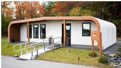
Pictured (Right): Factory of the Future 1.0. Pictured (Left): A home produced by the world's previous largest 3D printer.

Would you like to live in a home that has been created by a 3D printer?