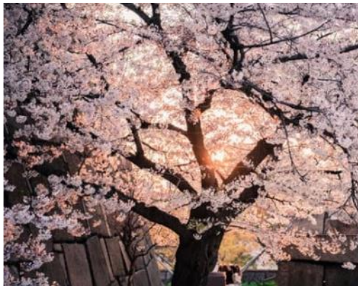
Pictured: Cherry blossom.

Trees and hedgerows are currently adorned with colourful blossom. Plants and trees that will go on to produce fruit, grow buds at first, which flower once warmer weather arrives in the spring. This is the blossom that we are seeing now. The flowers attract bees